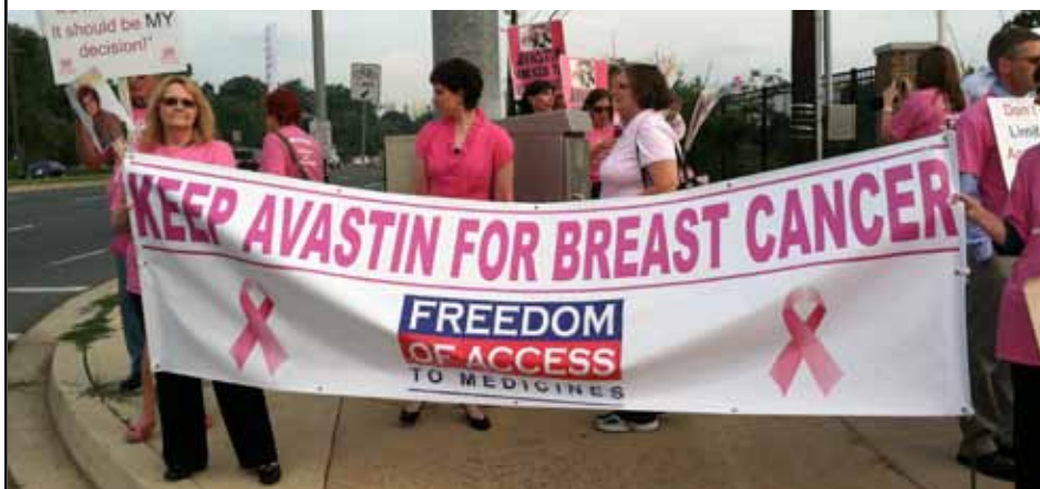
Protesters outside the FDA White Oak campus, June 28, before the Avastin hearing.